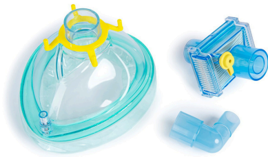
Pall Patient Kit

Pall Medical (part of Cytiva), we envision a world in which access to life-changing therapies transforms human health and we serve healthcare professionals, medical device manufacturers and patient with filtration and membrane solutions. Our medical applications are respiratory, surgical gas, cell therapy, healthcare water and IV (intravenous) filtration.