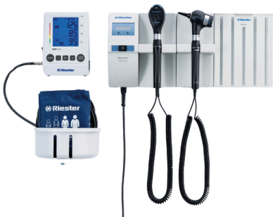
Ri-former RBP-100 Wall Unit