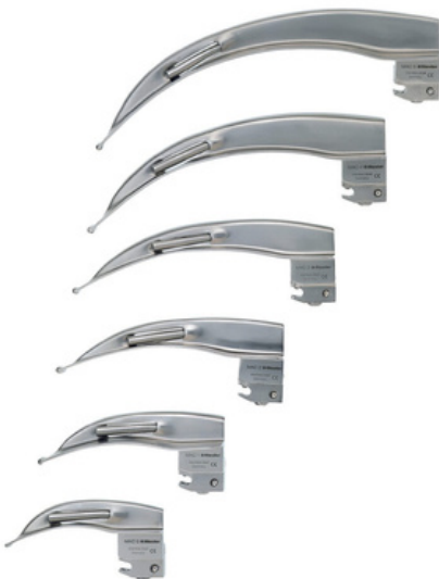
Macintosh Laryngoscope Blades