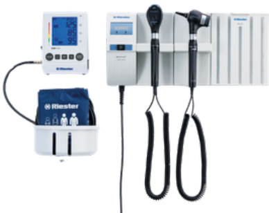
Ri-former RBP-100 Wall Unit