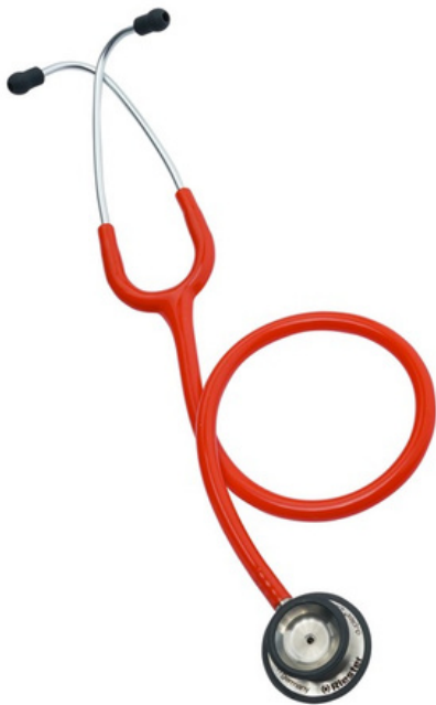
Stethoscope Duplex 2.0 Red Steel